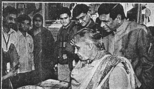
NDPL participated in the Eco Meet organised by the Government of Delhi. Smt. Sheila Dikshit, Hon'ble Chief Minister of Delhi visited the NDPL stall.